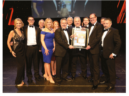
Plymouth Citybus pick up the Large Business of the Year Award at The Herald Business Awards

"For the last three years Plymouth Citybus have topped the Go-Ahead Group staff engagement figures, surveyed on a yearly basis."