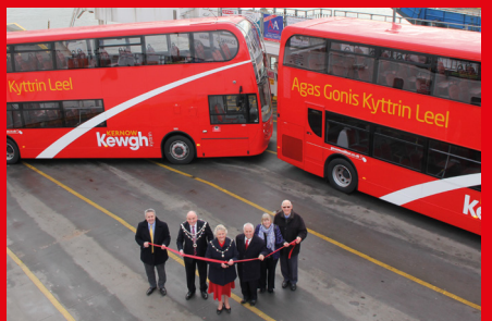
Go Cornwall Bus bi-lingual buses launched early 2016 aboard the Torpoint Ferry with members of both Plymouth City Council and Torpoint Town Council present.