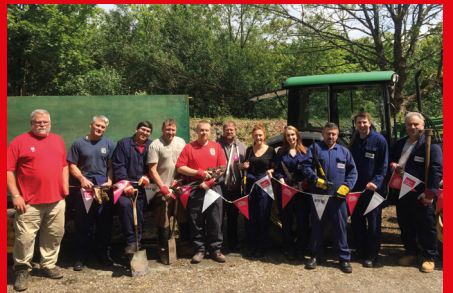
Managers and engineers donated 100 hours to clear and re fence a new cycle way at the National Trust's Sultrum House as part of the Business in the Community initiative.