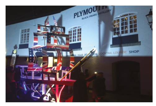
The Mayflower 400 event.

"We aim to reduce personal accidents within the workplace by means of thorough training, instruction and information of correct and safe working procedures."