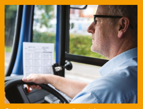
Our drivers are environmentally minded