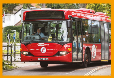
Our Crawley Town Football Club bus is popular with football fans and helps us build relationships with the community.