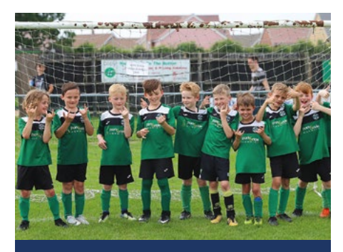
Under -11s Horsford FC team in their sponsored Norwich Park & Ride kit this summer.

One such example is the 81 coach route previously run by Coach Services. Once at risk of being withdrawn, the route is now managed by Konectbus and provides a much-needed transport link for the local community.