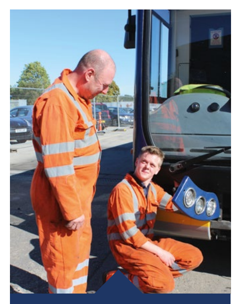
One of our engineering apprentices learning from an established member of the engineering team.

Norwich is one of 32 UK cities exceeding air pollution levels set by the World Health Organization, a new report says. World Health Organization data shows the areas have fine particle air pollution levels above its limit of 10 micrograms per cubic metre. Particular areas in Norwich have been identified as having especially high levels, such as Castle Meadow in the city centre.