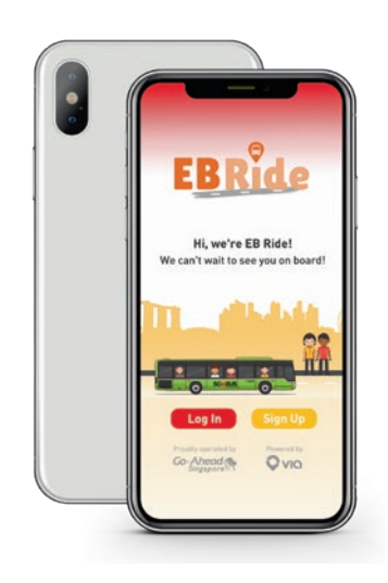
The EB Ride app has been well-received by colleagues who utilise its service

This digital move from the traditional employee bus service, where allocated service numbers would ply fixed routes and call only at selected bus stops along the way, was made with the intention to operate our employee bus service with greater efficiency. This on-demand service utilises an algorithm to plan routes according to colleagues' individual journeys, minimising their wait and travel time.