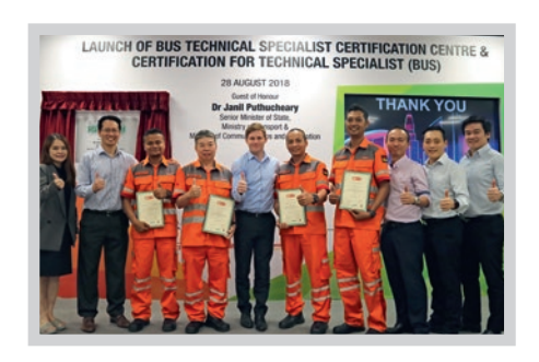
CTS graduates, posing proudly with their certificates, flanked by representatives of our management team.

As the CTS is a structured approach to recognising TS' skill levels through the endorsement of an external body, it is a