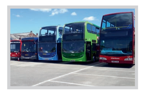
Bus enthusiasts enjoy a sunny day at Mid-Norfolk railway's vintage bus and coach rally.

Konectbus displayed four buses on the day with employees on-hand to supply information and supervise children (and parents!) sitting in the drivers' seats. It was also an opportunity to give out our '20 years of Konectbus' flyer, which included the company history, upcoming news and recruitment information.