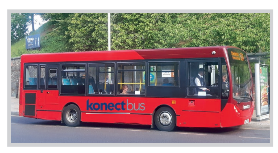
The Euro 5 now operating across Norwich City Centre.

The reduction in losses and wider improvements to business efficiency has led to a decision to invest in brand new vehicles in 2019.