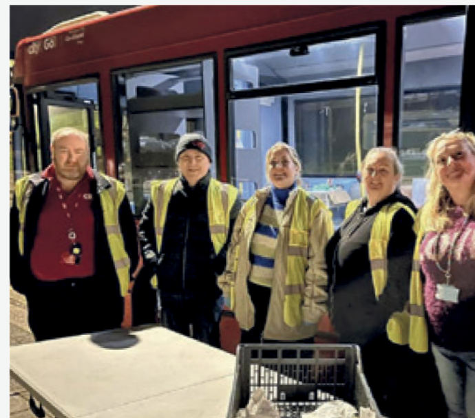
Go South West colleagues volunteering at the 'Soup Run', offering soup and blankets to people in need.