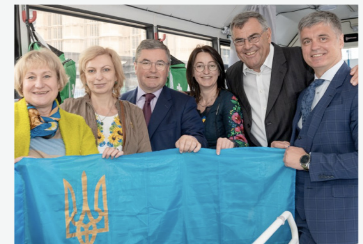
His Excellency Vadym Prystaiko, Ambassador of Ukraine to the United Kingdom, receiving the bus donated to Ukraine.

On another initiative, following the devastating earthquake on 6th February 2023 in Turkey, Go-Ahead gathered its colleagues for a match funding that raised more than £12,000 for the Disasters Emergency Committee. Head office colleagues also raised money for other noble causes, through a Macmillan Coffee morning hosted in Newcastle, and by joining the Save the Children's Christmas Jumper Day – which was celebrated in our head offices in London and Newcastle and also by our colleagues at Go North West and Go-Ahead London.